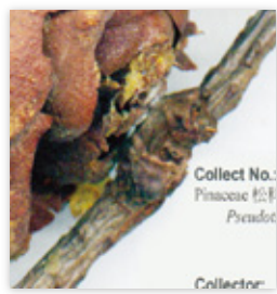
The ObjectScan 1600 Scanner

ObjectScan 1600 has a color linear CCD with resolution up to 1,600 pixels per inch, equaling that of 1Gigabyte. With the built-in 48-bit ADC (Analog to Digital Converter), the whole specimen as well as details of surface textures can be precisely captured and presented in high fidelity format.